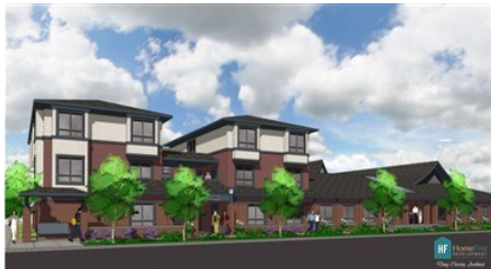
Proposed Apartment Building at the Portsmouth Union Church in North Portland, OR