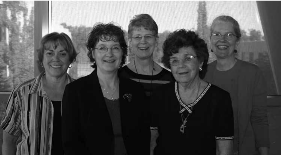
District Administrative Assistants